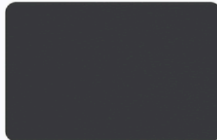
Model: L6 Black