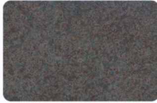
Model: L3 Grey

Varying hues of bronze with red undertones