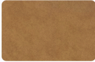
Model: L1 Chestnut

Varying hues of bronze with red undertones