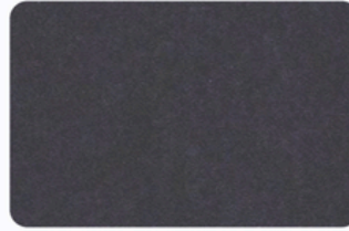
Model: L4 Navy