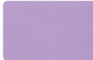
Model: L7 Purple

Solid, slightly textured purple (Allergen-Free Color Code)