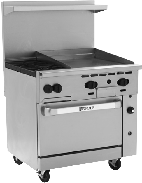
Model C36S-2B24GN (shown with optional casters)