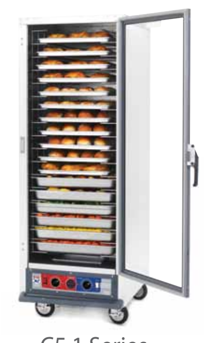
C5 1 Series

An ideal solution for proofing and basic holding needs.