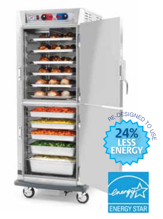
C5 9, 8 & 6 Series

High-Performance cabinets with 3 levels of control. Precise moisture, precise temperature, or analog control.