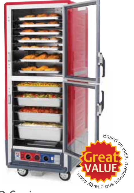
C5 3 Series with Insulation Armour™