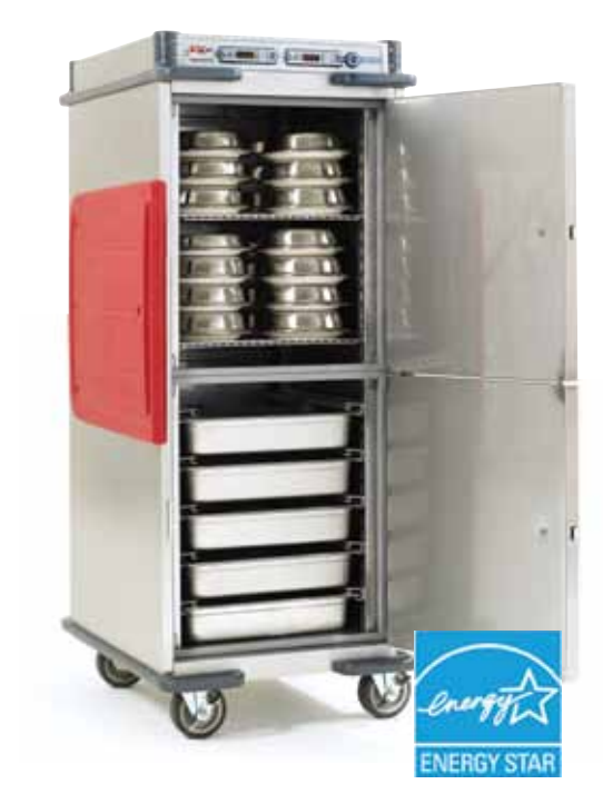
C5 T-Series with Transport Armour™ Built for transport, not adapted. Keeps food safe twice as long.

Proven Non-insulated cabinets provide value and reliability.