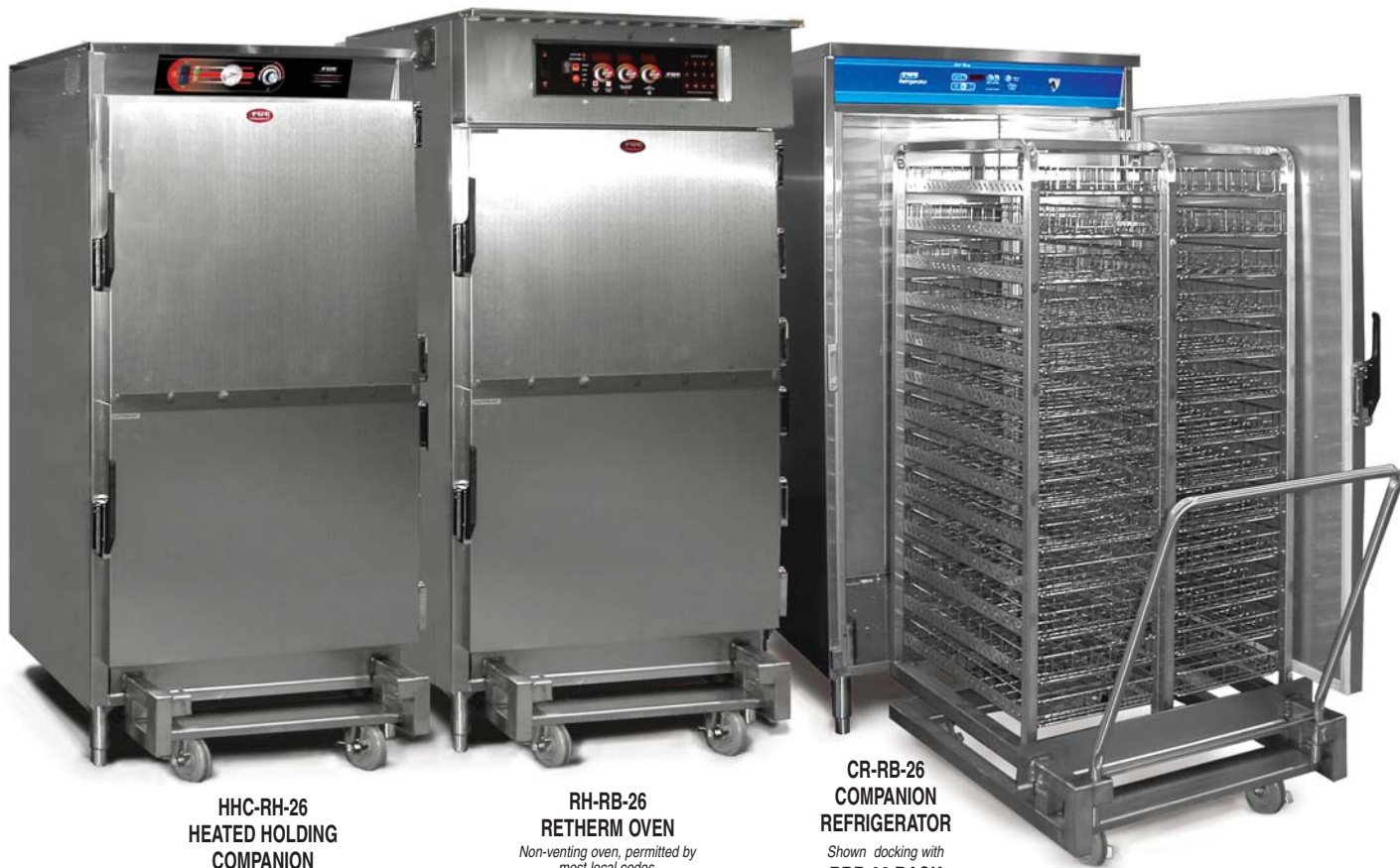
HHC-RH-26 HEATED HOLDING COMPANION