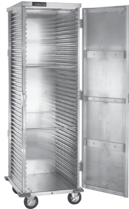
100-1841-DSD (Shown with optional corner bumpers)