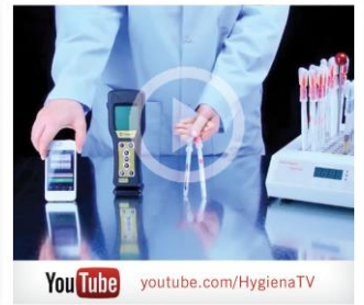
Watch an instructional demo at youtube.com/HygienaTV

MicroSnap Coliform is a rapid test for detection and enumeration of Coliform bacteria. The test uses a novel bioluminescent reaction that generates light when enzymes that are characteristic of Coliform bacteria react with specialized substrates. The light generating signal is then quantified in the EnSURE luminometer. Results are available in 8 hours or less, depending upon required level of detection. Single figure organisms can be detected in 8 hours, delivering results in the same working day or shift.