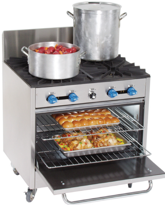
Model FK430 (shown with extra rack & optional casters)