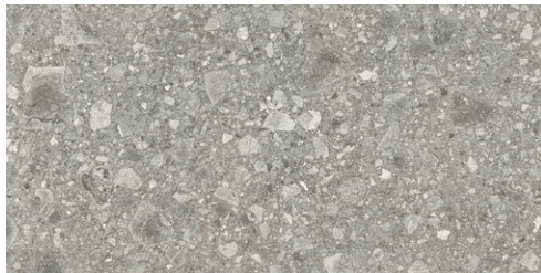
18x36 Natural - Grigio