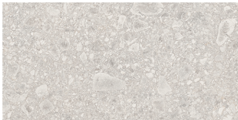
18x36 Natural - Bianco