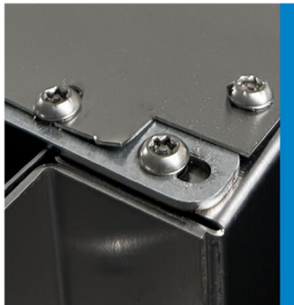
Tamper-proof screws used throughout