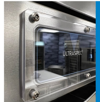
Lexan-covered controller for product safety