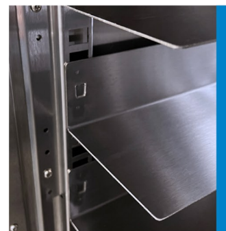
Welded-in-place tray slides for either hotel or full sheet pans

Specially fortified for a 150lbs weight limit!