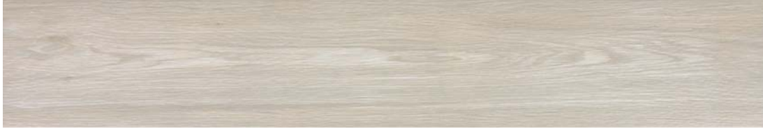
6" x 36" VINTAGE WOOD DUNE HD PORCELAIN TILE 62-700