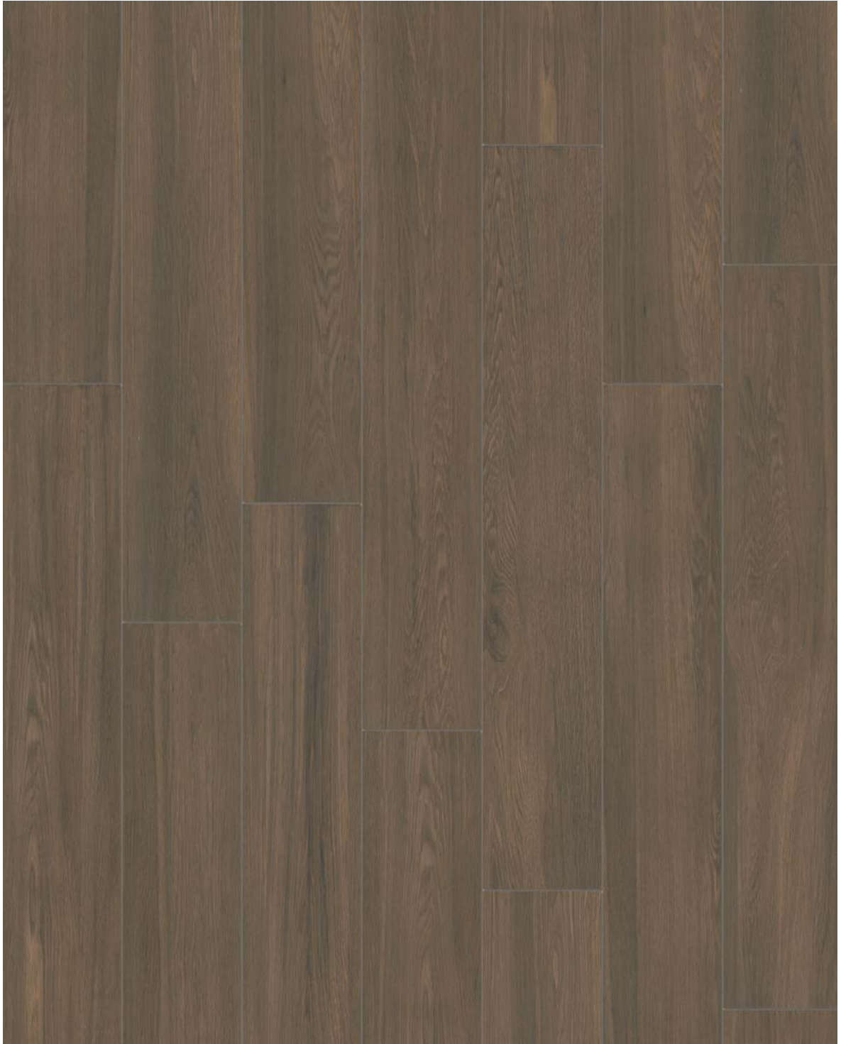
6" x 36" VINTAGE WOOD CINNAMON HD PORCELAIN TILE