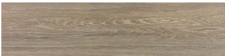
6" x 24" VINTAGE WOOD SADDLE HD PORCELAIN TILE 62-501