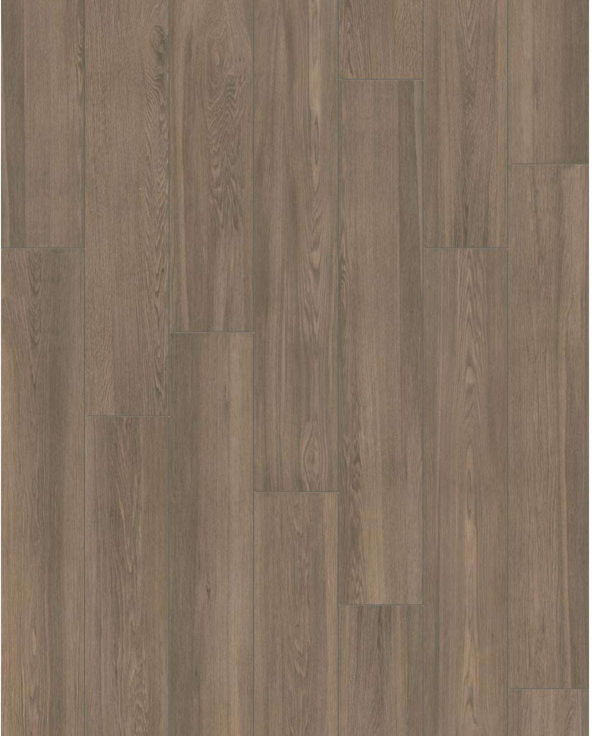
6" x 36" VINTAGE WOOD SADDLE HD PORCELAIN TILE