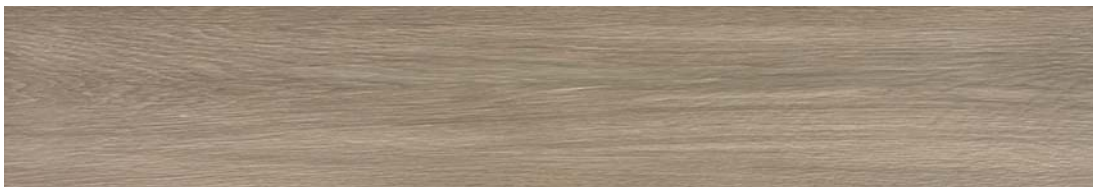
6" x 36" VINTAGE WOOD SADDLE HD PORCELAIN TILE 62-701