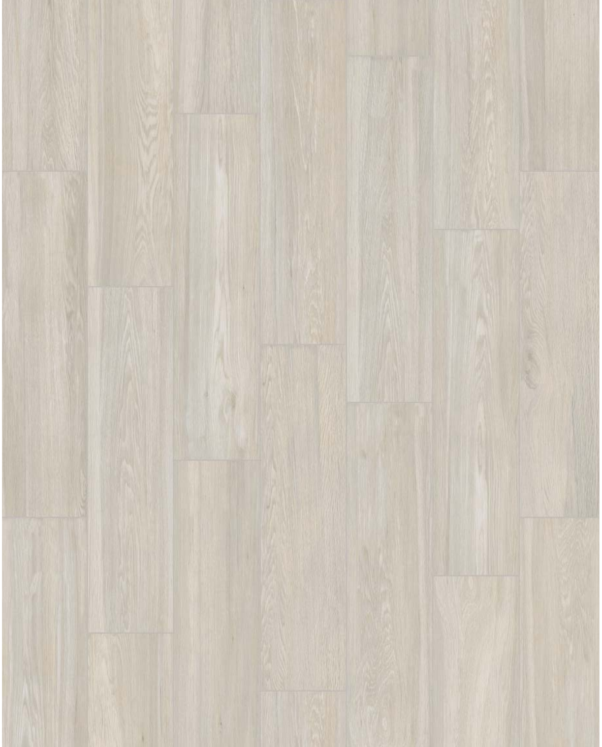
6" x 24" VINTAGE WOOD DUNE HD PORCELAIN TILE