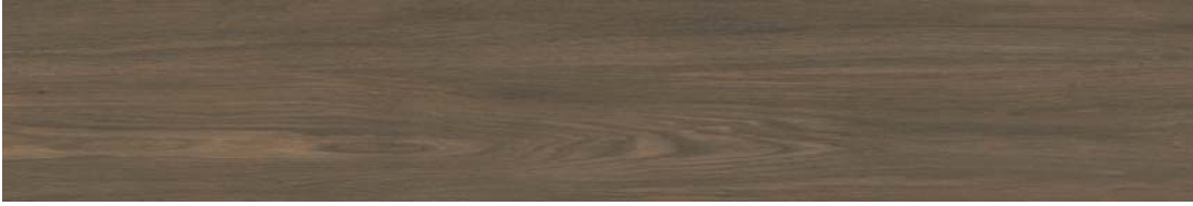
6" x 36" VINTAGE WOOD CINNAMON HD PORCELAIN TILE 62-702