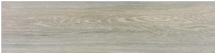
6" x 24" VINTAGE WOOD ASH HD PORCELAIN TILE 62-503