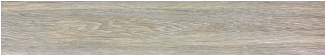
6" x 36" VINTAGE WOOD ASH HD PORCELAIN TILE 62-703