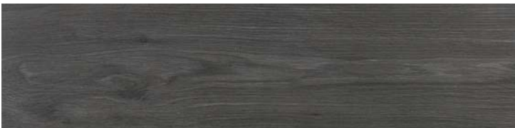
6" x 24" VINTAGE WOOD CARBON HD PORCELAIN TILE 62-504