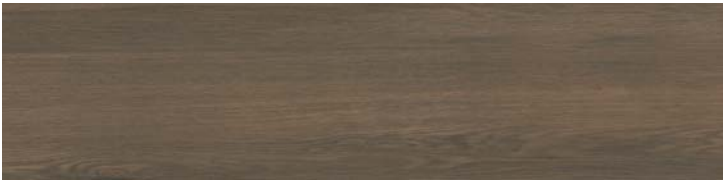
6" x 24" VINTAGE WOOD CINNAMON HD PORCELAIN TILE 62-502