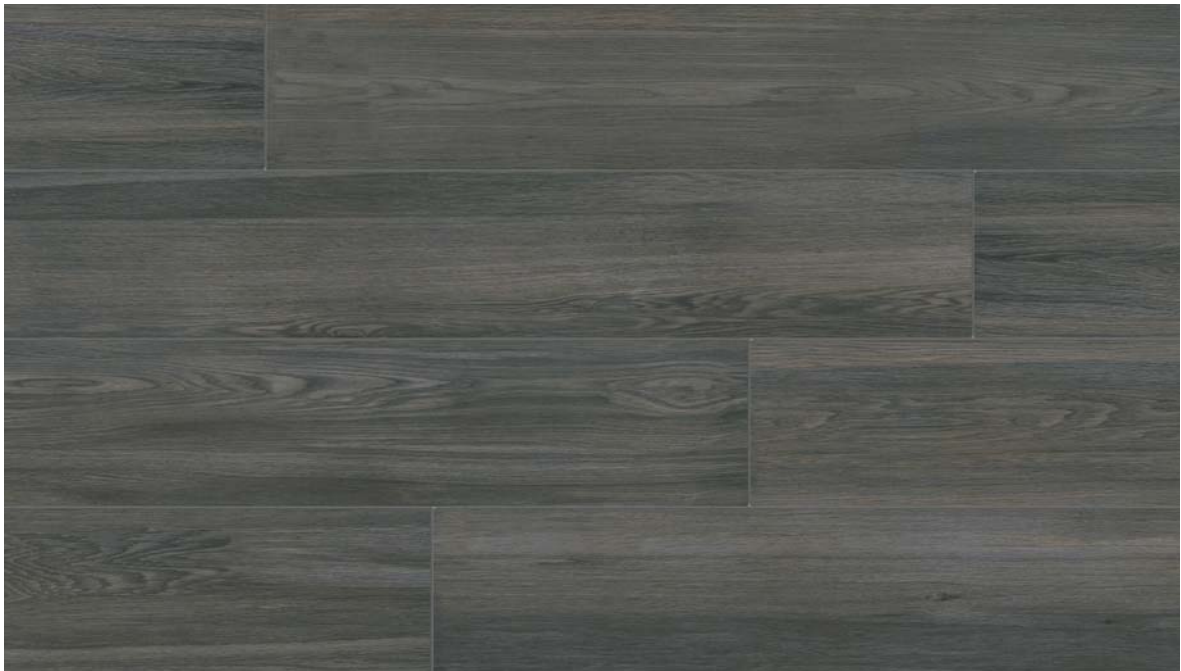
6" x 36" VINTAGE WOOD CARBON HD PORCELAIN TILE