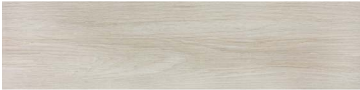
6" x 24" VINTAGE WOOD DUNE HD PORCELAIN TILE 62-500