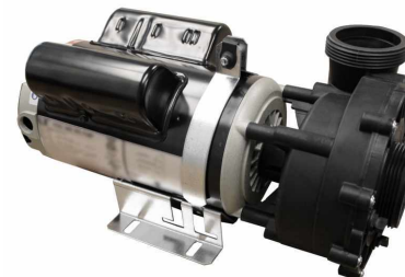
Pump with Bracket Installed