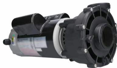
For Bracketless Pumps