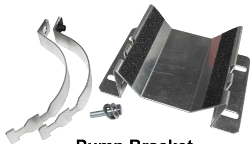
Pump Bracket PT# 6000-53X-HQ