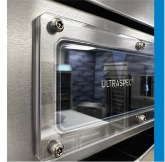
Lexan-covered controller for product safety