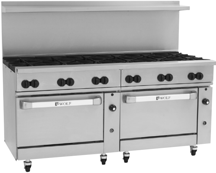
Model C72SS-12BN (shown with optional casters)