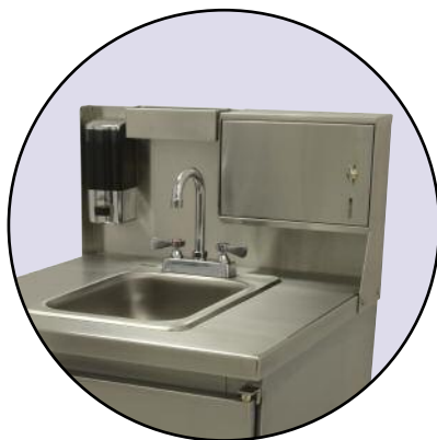
OPTIONAL TA-MSC-1 Shown