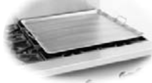
LOG4 (lift off griddle)