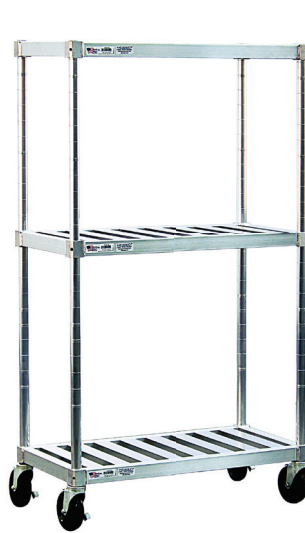
Adjustable Unit with Casters