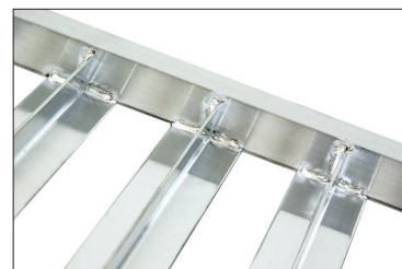
T-Bar Shelf -- Underside

This information is for general sales and engineering use only. New Age Industrial reserves the right to modify or make changes at any time without notice to materials and specifications.