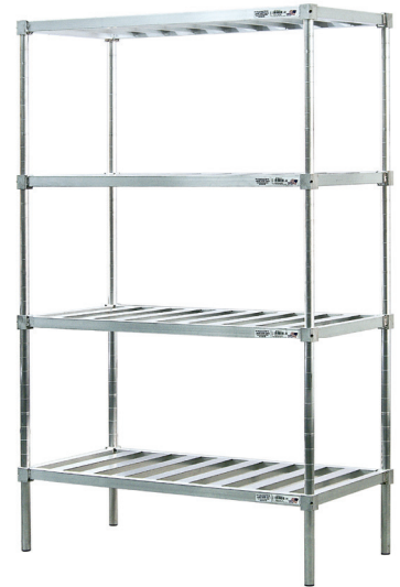
Adjustable Stationary Unit