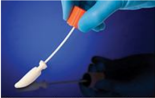
1. Remove sampling device from container and swab the surface.

incubated along side with the environmental samples) in each set of samples is recommended.