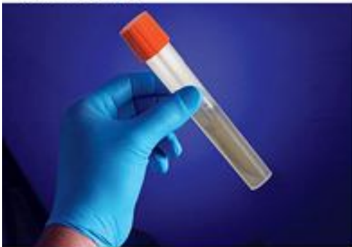
3. Incubate at 37 °C for 30 hours.*