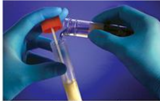
2. Return sampling device to container. Add media.