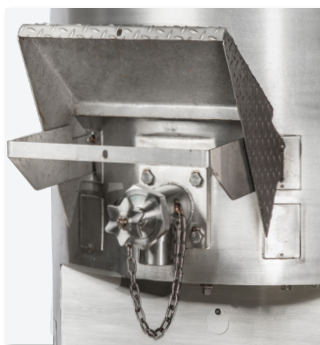
Welded security chain on draw-off valve protected by locking step cover (lock not included)