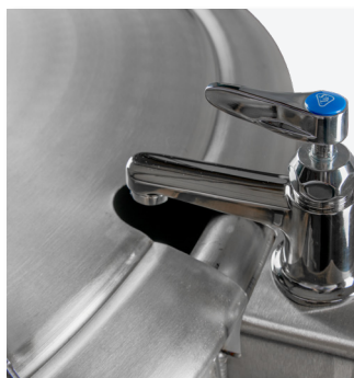
Notched lid with welded non-rotating faucet