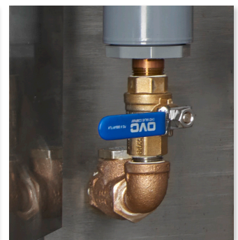
Locking water valve

Masterful design. Precision performance. State-of-the-art innovation. For over 150 years, Vulcan has been recognized throughout the world for top-quality, energy-efficient commercial cooking equipment that consistently produces spectacular results. Trust Vulcan to help make your foodservice operation run just right—every time.