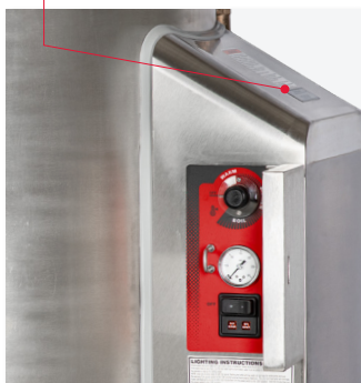
Sloped control panel features locking protective cover (lock not included)