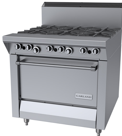
Model M43R Shown with Optional Backguard