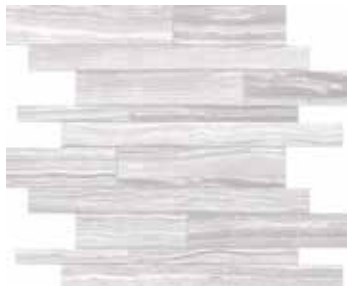
ERAMOSA ICE HD PORCELAIN RANDOM STRIP MOSAICS MATTE 69-187