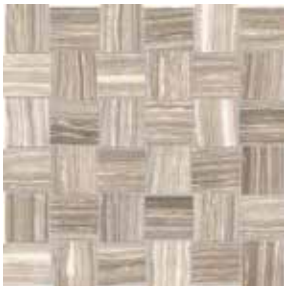
2" x 2" ERAMOSA CLAY BASKETWEAVE HD PORCELAIN MOSAICS 69-232