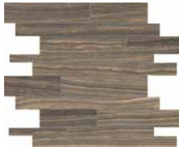
ERAMOSA NATURAL HD PORCELAIN RANDOM STRIP MOSAICS MATTE 69-189