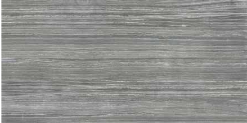
18" x 36" ERAMOSA CARBON HD RECTIFIED PORCELAIN TILE MATTE 68-300