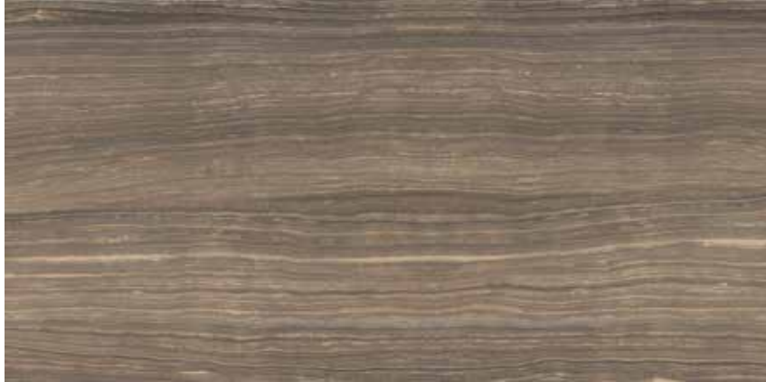
18" x 36" ERAMOSA NATURAL HD RECTIFIED PORCELAIN TILE MATTE 68-303