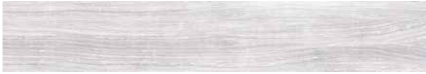
6" x 36" ERAMOSA ICE HD RECTIFIED PORCELAIN TILE MATTE 62-706