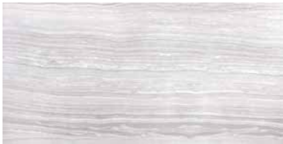
12" x 24" ERAMOSA ICE HD PORCELAIN TILE POLISHED RECTIFIED 69-840, MATTE 69-178