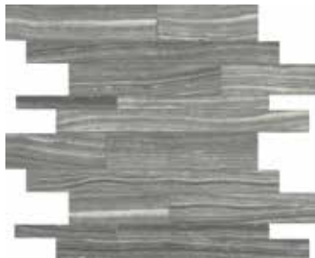
ERAMOSA CARBON HD PORCELAIN RANDOM STRIP MOSAICS MATTE 69-186