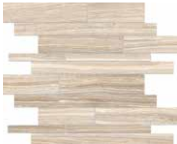
ERAMOSA SAND HD PORCELAIN RANDOM STRIP MOSAICS MATTE 69-237