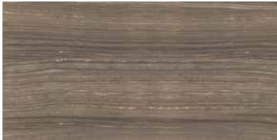
12" x 24" ERAMOSA NATURAL HD PORCELAIN TILE POLISHED RECTIFIED 69-844, MATTE 69-181