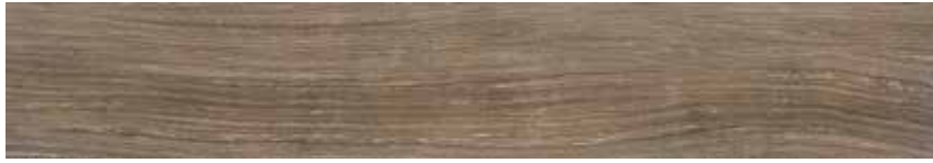
6" x 36" ERAMOSA NATURAL HD RECTIFIED PORCELAIN TILE MATTE 62-708