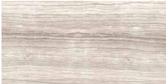
12" x 24" ERAMOSA CLAY HD PORCELAIN TILE POLISHED RECTIFIED 69-842, MATTE 69-180