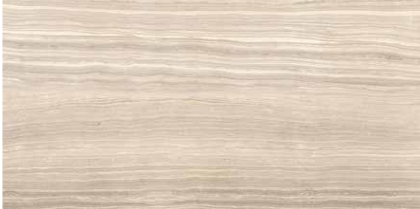
18" x 36" ERAMOSA SAND HD RECTIFIED PORCELAIN TILE MATTE 68-304