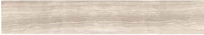
6" x 36" ERAMOSA CLAY HD RECTIFIED PORCELAIN TILE MATTE 62-707