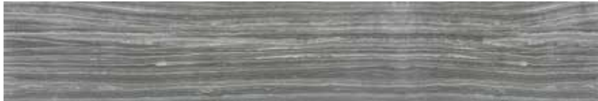
6" x 36" ERAMOSA CARBON HD RECTIFIED PORCELAIN TILE MATTE 62-705