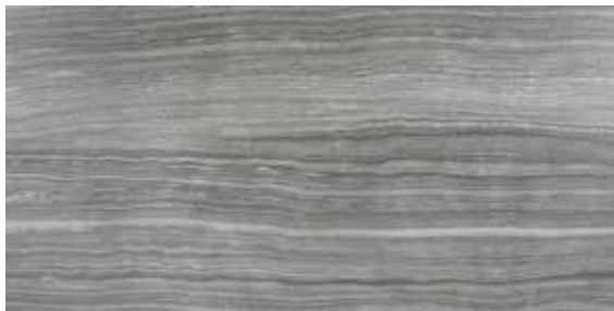
12" x 24" ERAMOSA CARBON HD PORCELAIN TILE POLISHED RECTIFIED 69-838, MATTE 69-177