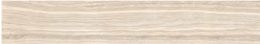
6" x 36" ERAMOSA SAND HD RECTIFIED PORCELAIN TILE MATTE 62-714