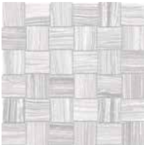
2" x 2" ERAMOSA ICE BASKETWEAVE HD PORCELAIN MOSAICS 69-231