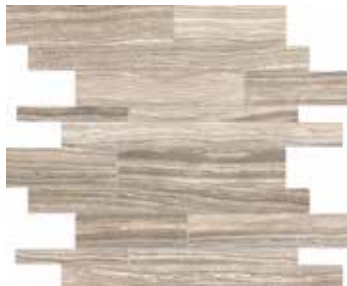
ERAMOSA CLAY HD PORCELAIN RANDOM STRIP MOSAICS MATTE 69-188