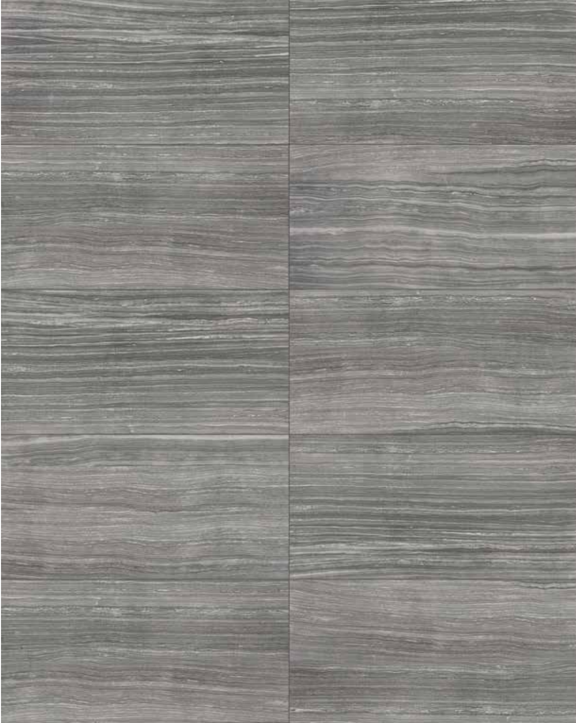
12" x 24" ERAMOSA CARBON HD PORCELAIN TILE