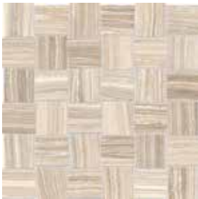
2" x 2" ERAMOSA SAND BASKETWEAVE HD PORCELAIN MOSAICS 69-234