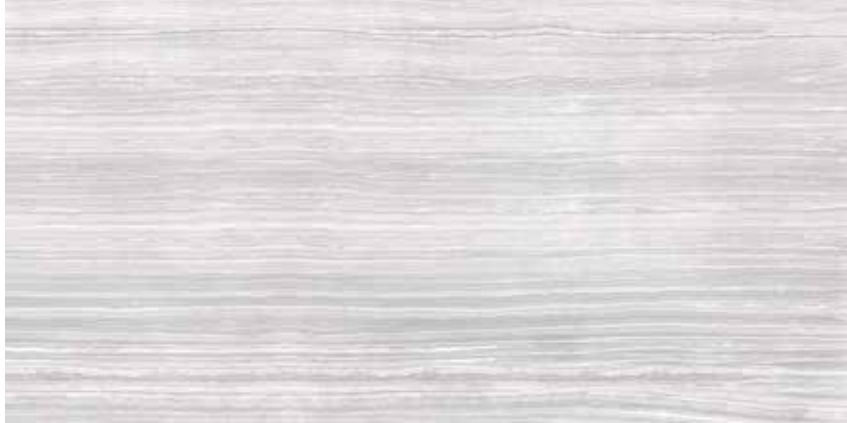
18" x 36" ERAMOSA ICE HD RECTIFIED PORCELAIN TILE MATTE 69-301