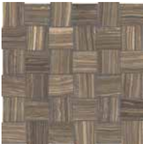
2" x 2" ERAMOSA NATURAL BASKETWEAVE HD PORCELAIN MOSAICS 69-233