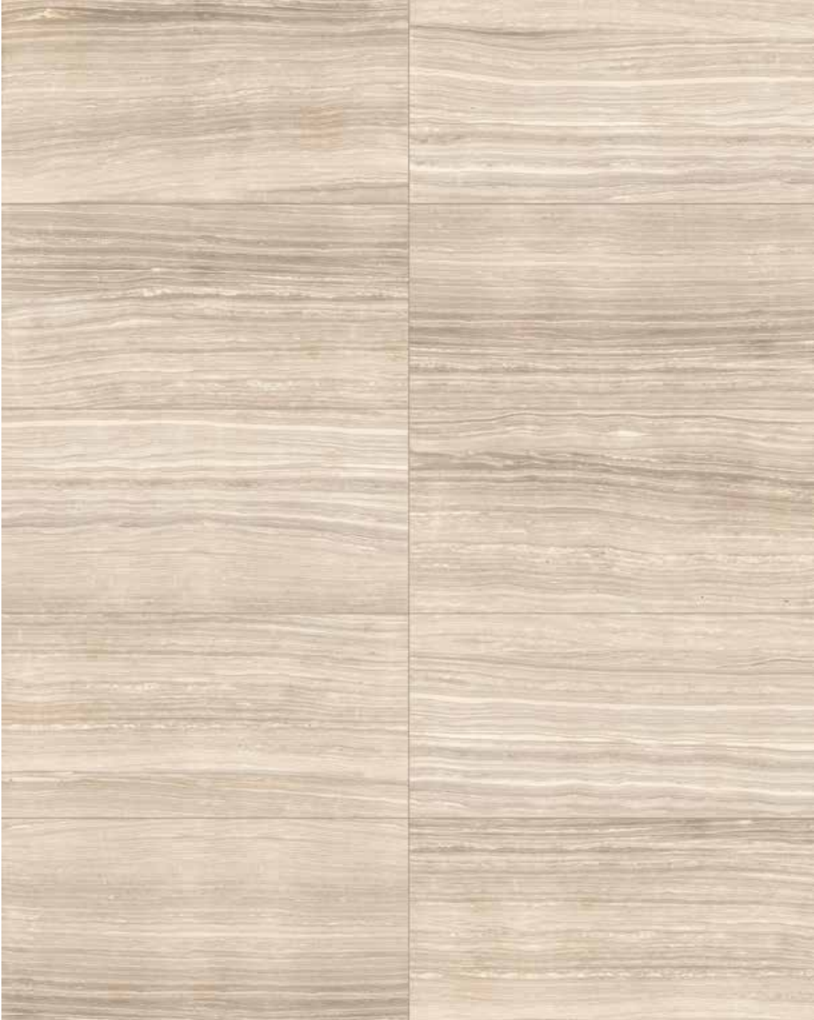
12" x 24" ERAMOSA SAND HD PORCELAIN TILE