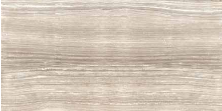
18" x 36" ERAMOSA CLAY HD RECTIFIED PORCELAIN TILE MATTE 69-302