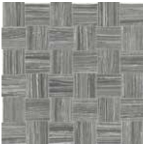
2" x 2" ERAMOSA CARBON BASKETWEAVE HD PORCELAIN MOSAICS 69-230