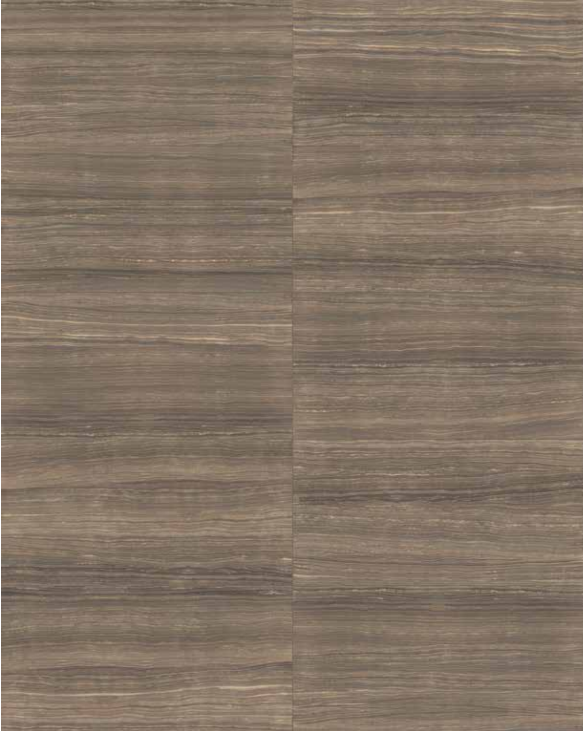
12" x 24" ERAMOSA NATURAL HD PORCELAIN TILE