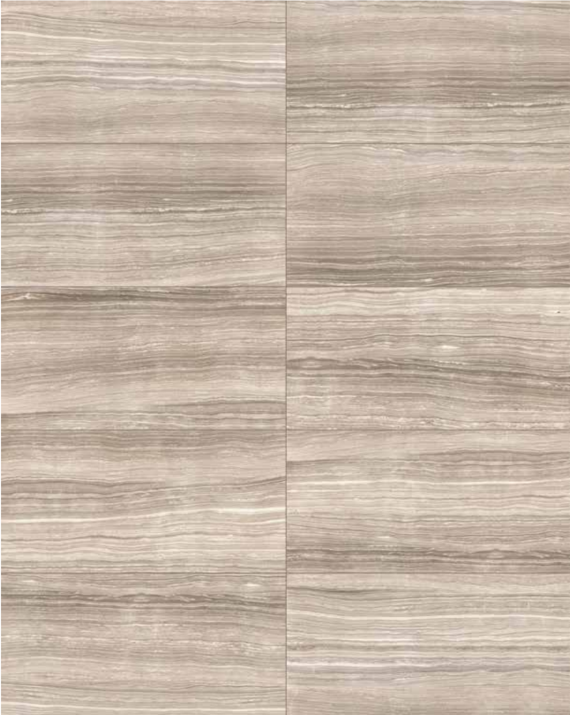
12" x 24" ERAMOSA CLAY HD PORCELAIN TILE