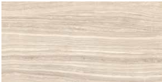
12" x 24" ERAMOSA SAND HD PORCELAIN TILE POLISHED RECTIFIED 69-861, MATTE 69-235