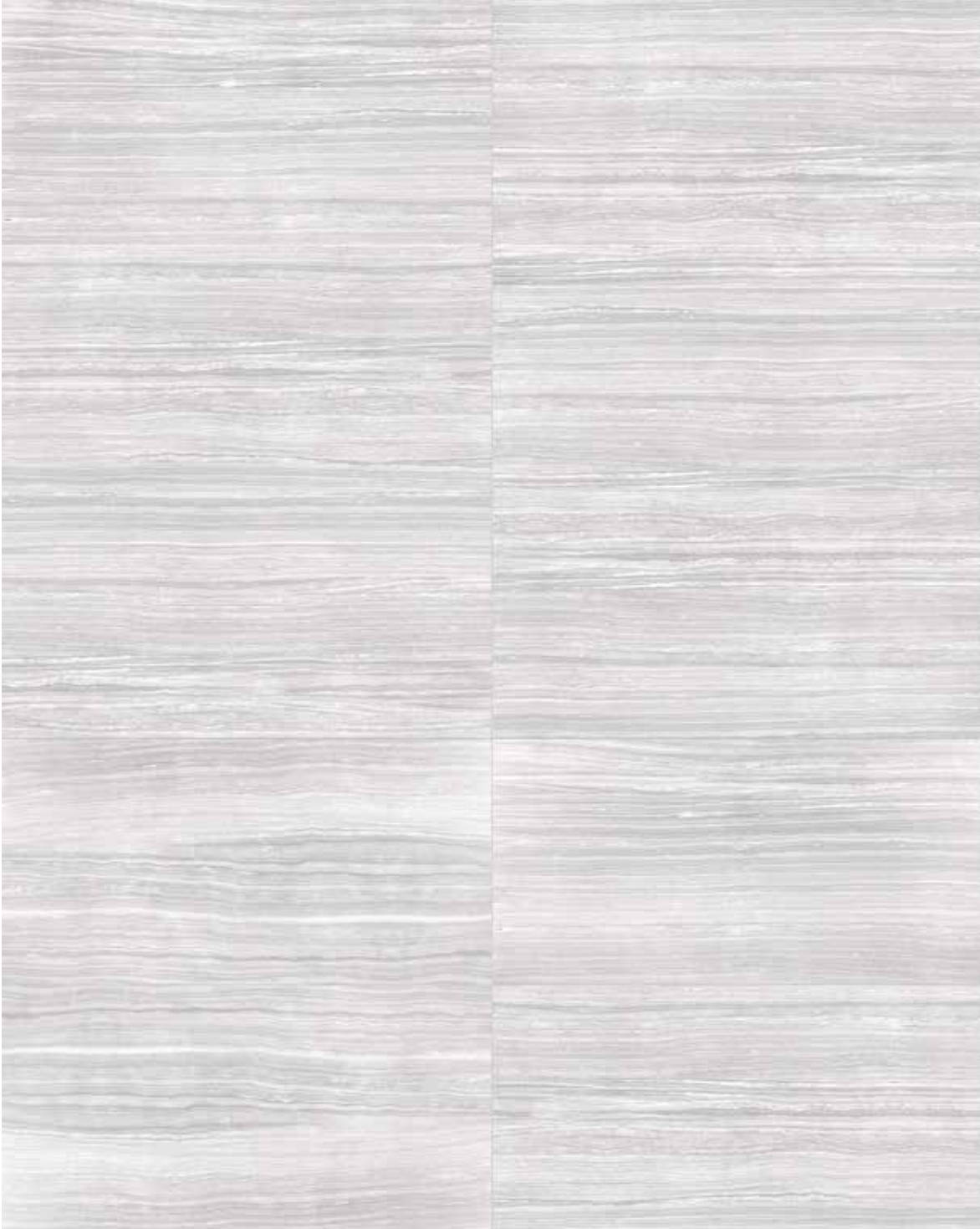
12" x 24" ERAMOSA ICE HD PORCELAIN TILE