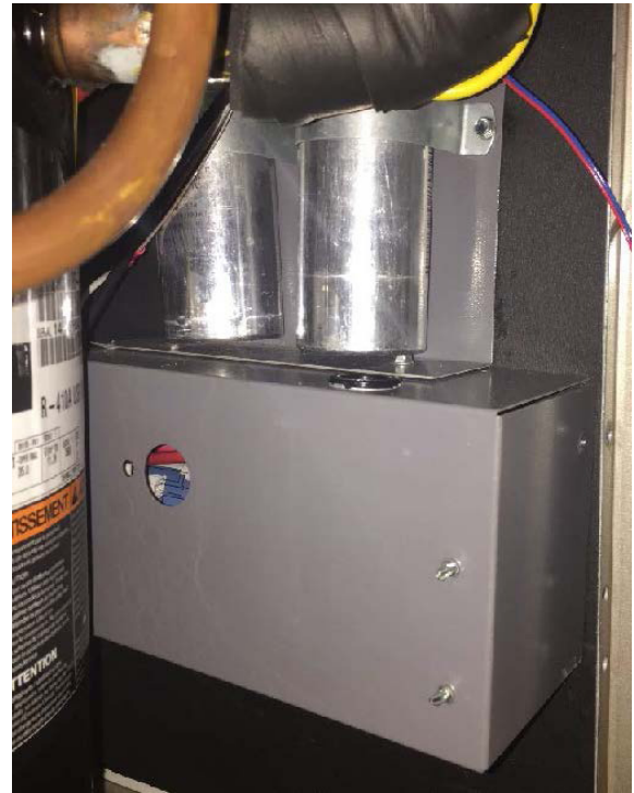
Figure 2: Capacitor Mounting Box

3. Remove the start and run capacitor mounting box (Figure 2) from the case by locating and removing the two screws on the external side of case.