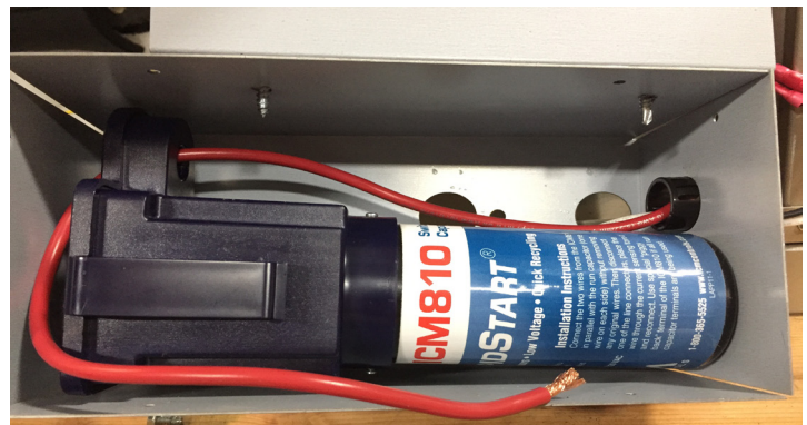
Figure 3: Wire Routing Through Hard Start Component

4. Verify and, if needed, reroute the run wire (red) through hard start component current sensing relay and back out of the box. (Figure 3). If additional compressor harness length is required, use supplied harness (PN 41P90-01NN)