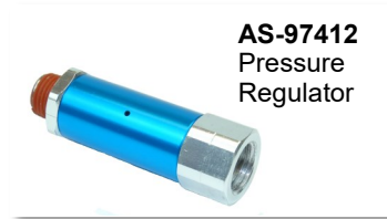
AS-97412 Pressure Regulator