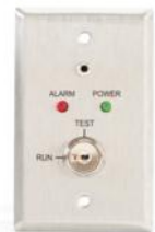
Fireray® 50RU/100RU Accessories