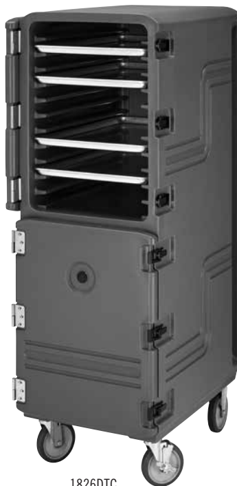
1826DTC (For Trays & Sheet Pans)