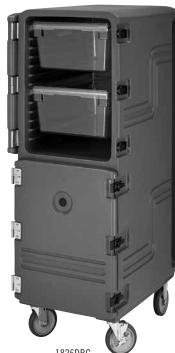
1826DBC (For Food Storage Boxes)