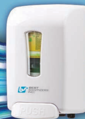
VersaClenz Manual MD10030 (White) MD10030B (Black)