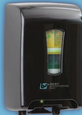
VersaClenz Touchless AD10048B (Black) AD10048 (White)