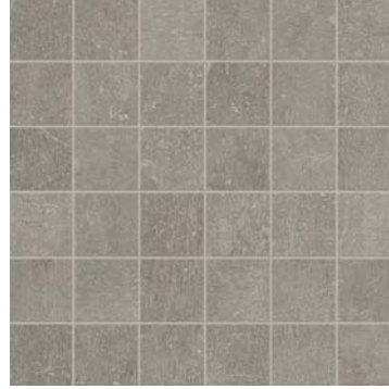
2" x 2" NEXUS CLAY HD PORCELAIN MOSAICS 69-936