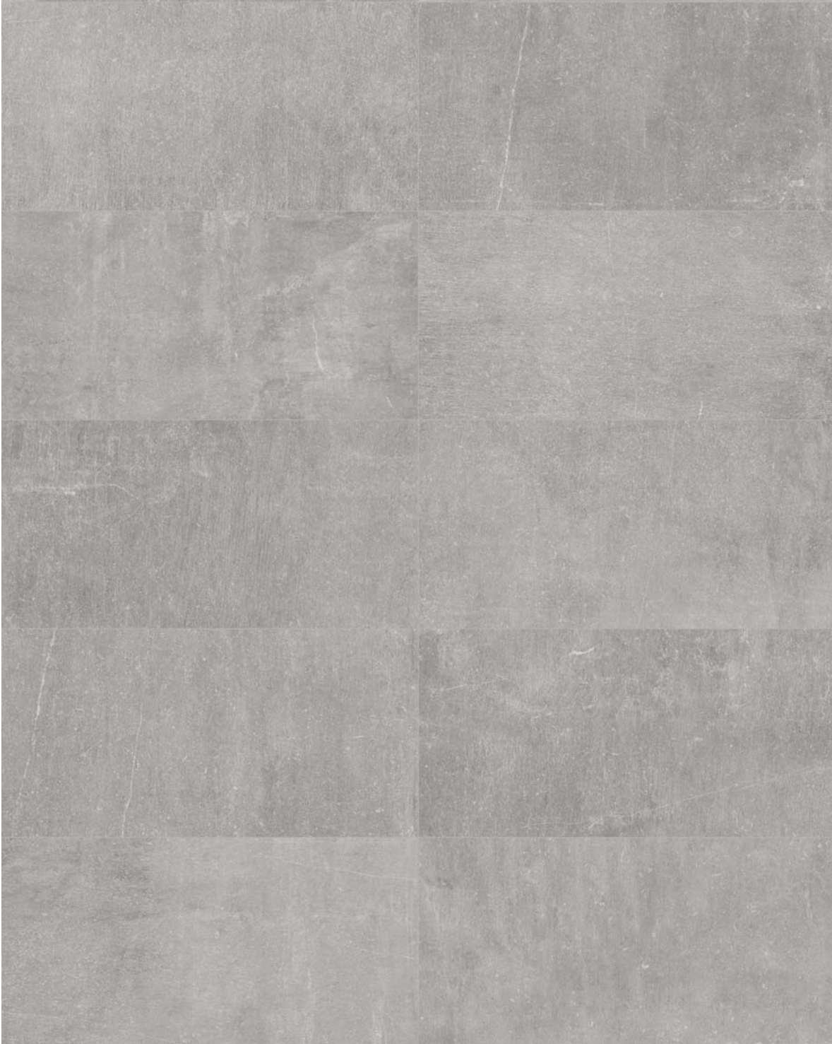
12" x 24" NEXUS MICA HD PORCELAIN TILE