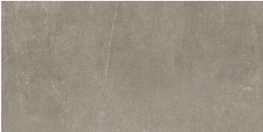
16" x 32" NEXUS CLAY HD PORCELAIN TILE 65-512