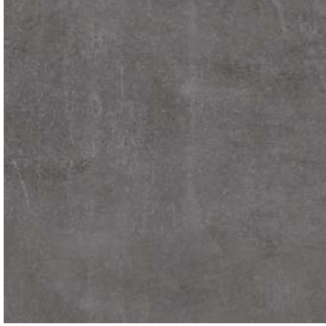
13" x 13" NEXUS GRAPHITE HD PORCELAIN TILE 63-558