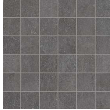
2" x 2" NEXUS GRAPHITE HD PORCELAIN MOSAICS 69-939