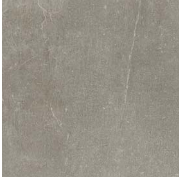
13" x 13" NEXUS CLAY HD PORCELAIN TILE 63-555