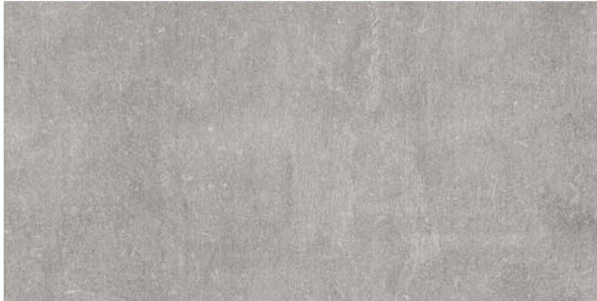
12" x 24" NEXUS MICA HD PORCELAIN TILE 69-930