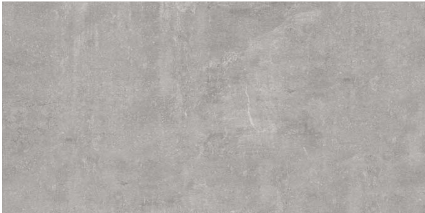
16" x 32" NEXUS MICA HD PORCELAIN TILE 65-514