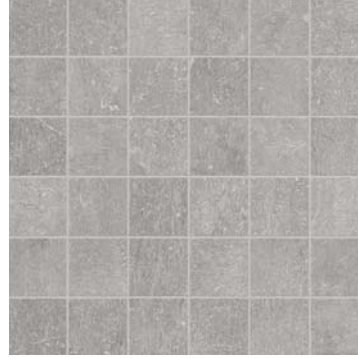
2" x 2" NEXUS MICA HD PORCELAIN MOSAICS 69-938