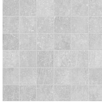
2" x 2" NEXUS ICE HD PORCELAIN MOSAICS 69-937