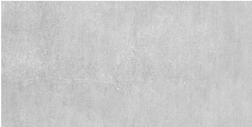
16" x 32" NEXUS ICE HD PORCELAIN TILE 65-513