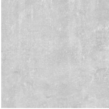
13" x 13" NEXUS ICE HD PORCELAIN TILE 63-556