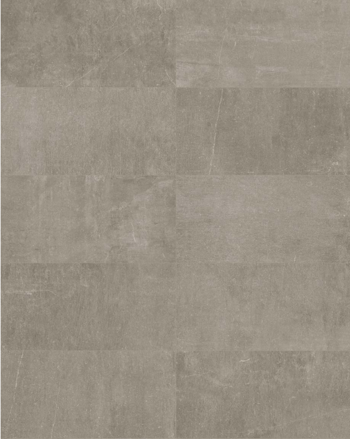
12" x 24" NEXUS CLAY HD PORCELAIN TILE