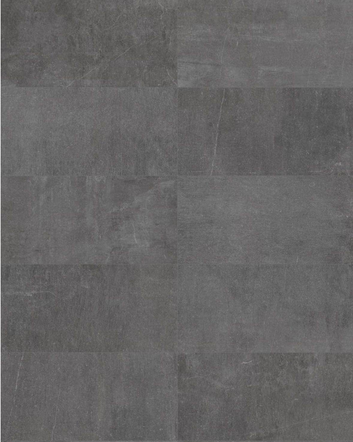
12" x 24" NEXUS GRAPHITE HD PORCELAIN TILE