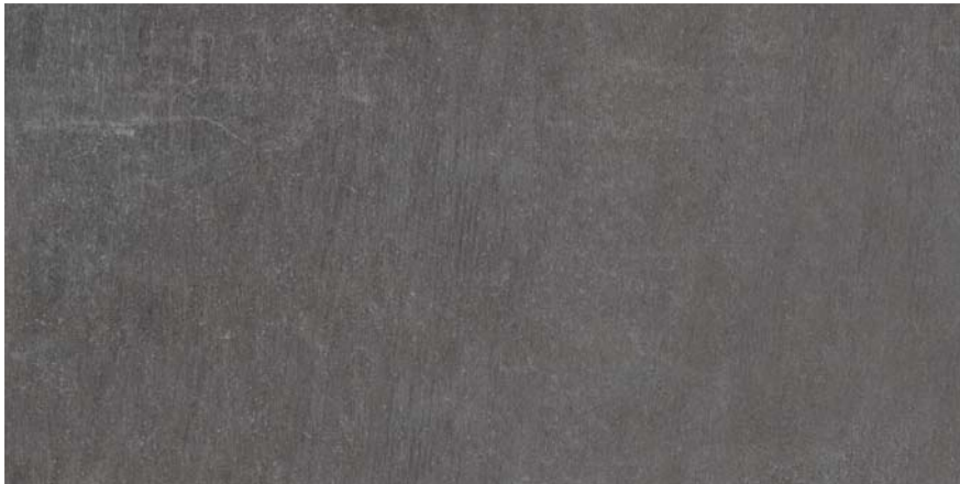
16" x 32" NEXUS GRAPHITE HD PORCELAIN TILE 65-515