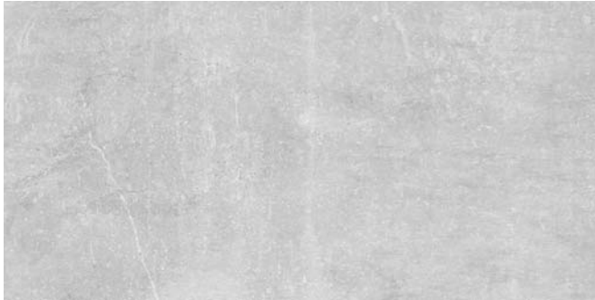
12" x 24" NEXUS ICE HD PORCELAIN TILE 69-929