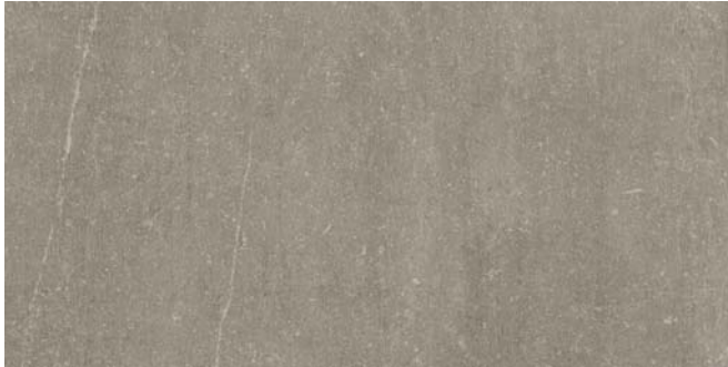
12" x 24" NEXUS CLAY HD PORCELAIN TILE 69-928