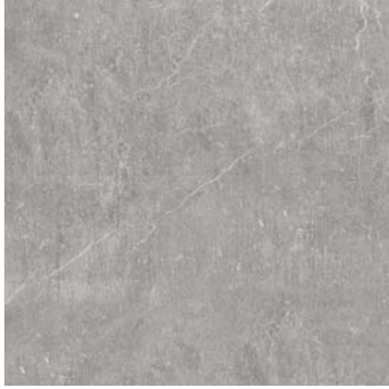
13" x 13" NEXUS MICA HD PORCELAIN TILE 63-557