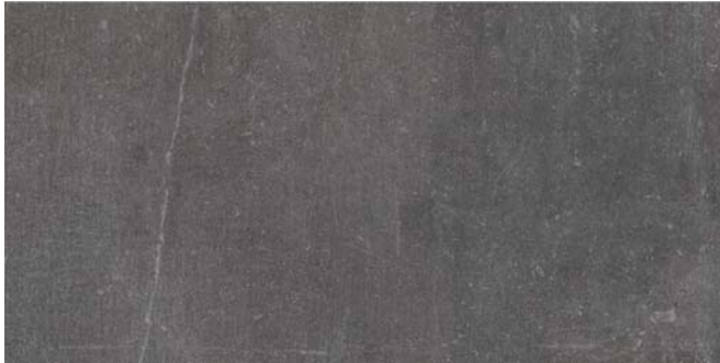
12" x 24" NEXUS GRAPHITE HD PORCELAIN TILE 69-931