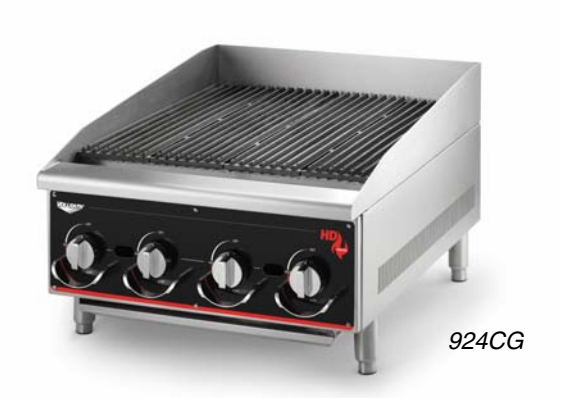
Cayenne® Heavy-Duty Charbroiler