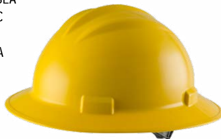
Model S71R (full-brim)