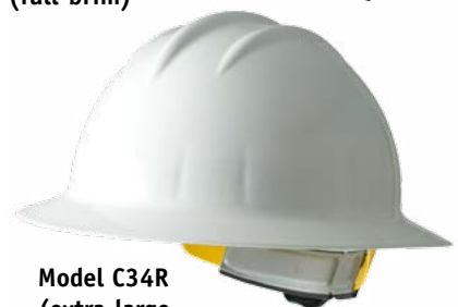
Model C34R (extra-large full-brim)