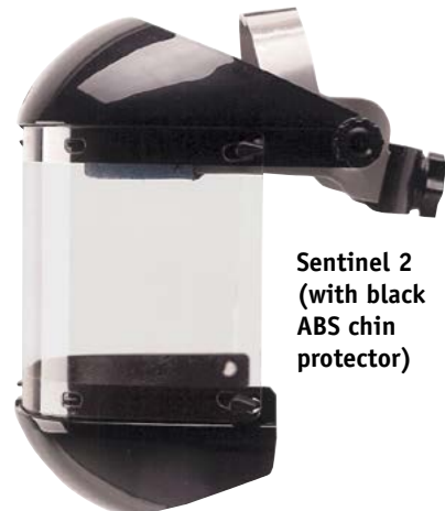
Sentinel 2 (with black ABS chin protector)