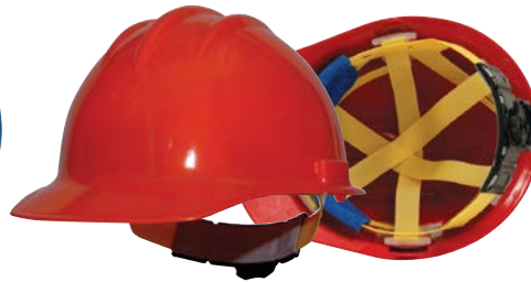
Classic Series Superior Comfort