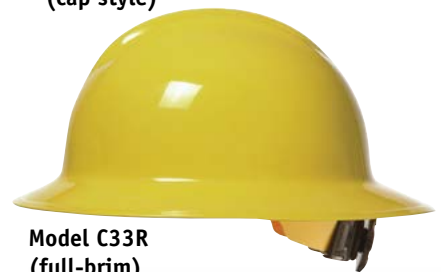
Model C33R (full-brim)