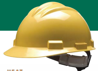
Model S61R (cap style)

Available with either a 4-point self-sizing pinlock or Flex-Gear® ratchet suspension system, Standard Series hard hats offer comfort, vertical adjustment and a snug fit. Made from high-density polyethylene, Models S51, S61, and S71 meet or exceed ANSI/ISEA Z89.1-2009, Type I, Class E & G requirements. Vented model S62 meets or exceeds ANSI/ISEA Z89.1-2009, Type I, Class C requirements. Model S51 also meets or exceeds CSA Z94.1-2005, Type 1, Class E & G and EN397:2012 requirements.