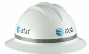
Bullard Logo Shop