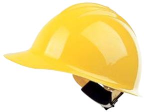
High Heat Series