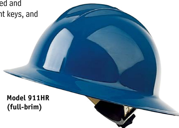
Model 911HR (full-brim)