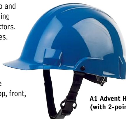
A1 Advent Helmet (with 2-point chinstrap)