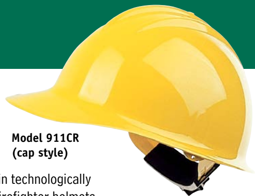
Model 911CR (cap style)

The 911C and 911H helmets meet or exceed ANSI/ISEA Z89.1-2009, Type I, Class E & G requirements.