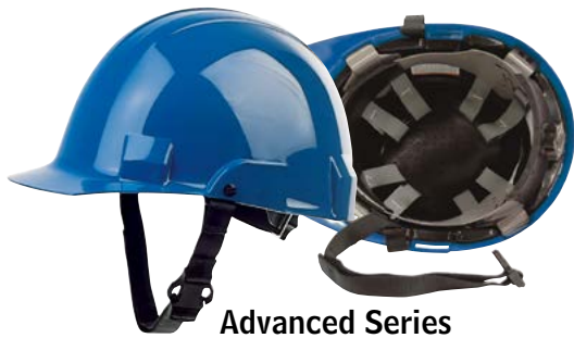
Advanced Series Extreme Safety