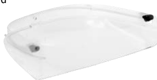
CP2 (clear polycarbonate chin protector)