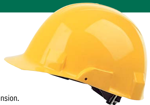
Vector Helmet (with ratchet suspension)

Offering lateral and top impact protection, Vector is nearly as lightweight as conventional hard hats. Vector helmets meet or exceed ANSI/ISEA Z89.1-2009, Type II, Class E & G, as well as CSA Z94.1-2005, Type 2, Class E & G, providing impact protection for the top, front, back, and side of the head.