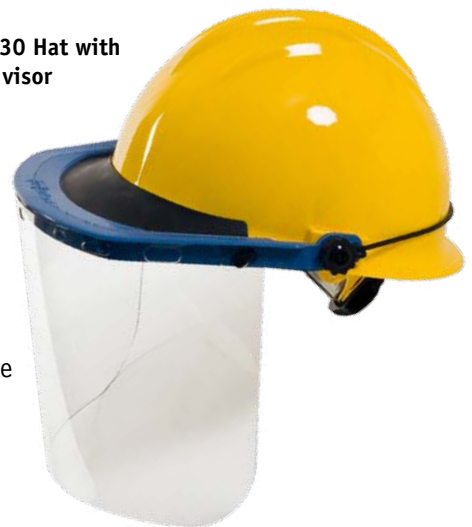
Model C30 Hat with Tritan™ visor