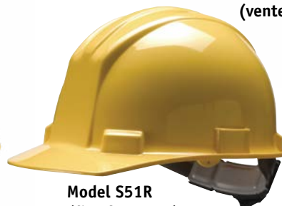
Model S51R (flat-front cap)