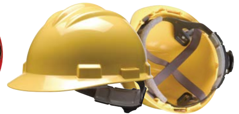
Standard Series Stylish Low-Profile