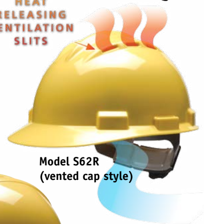
Model S62R (vented cap style)