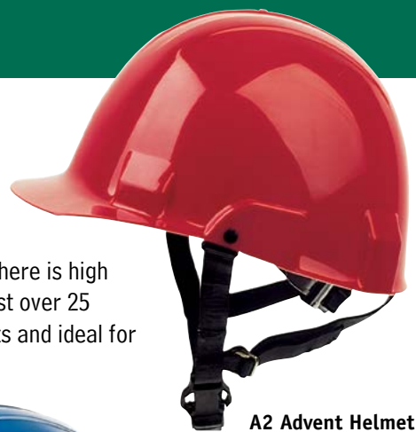
A2 Advent Helmet (with 3-point chinstrap)

Offering lateral and top impact protection, Advent helmets meet or exceed ANSI/ISEA Z89.1-2009, Type II, Class E & G, providing impact protection for the top, front, back, and side of the head.