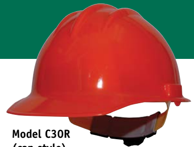
Model C30R (cap style)

All Classic hard hats and caps are made from high-density polyethylene and come equipped with Bullard 6-point self-sizing pinlock or Flex-Gear® ratchet suspension system. Both suspension systems allow for a truly customized and comfortable fit with 1" wide seamless nylon straps, vertical adjustment keys, and an absorbent cotton brow pad. All Classic hats and caps meet or exceed ANSI/ISEA Z89.1-2009, Type I, Class E & G requirements. Models C30 and C33 also meet or exceed CSA Z94.1-2005, Type 1, Class E & G requirements. The new, extra-large C34 accommodates larger heads and provides 12.5 percent more interior space.