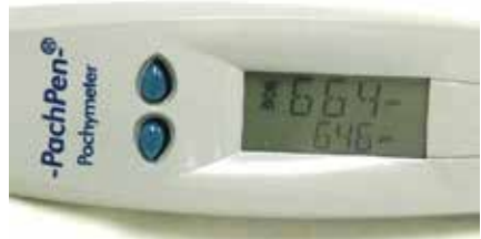
Figure 3.6 - Measurement Screen Starting New Patient

WARNING! THE PROBE TIP MUST BE PROPERLY DISINFECTED BEFORE TAKING ANY MEASUREMENTS ON A NEW PATIENT.