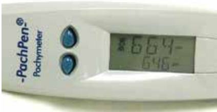
Figure 3.7 - True IOP Screen