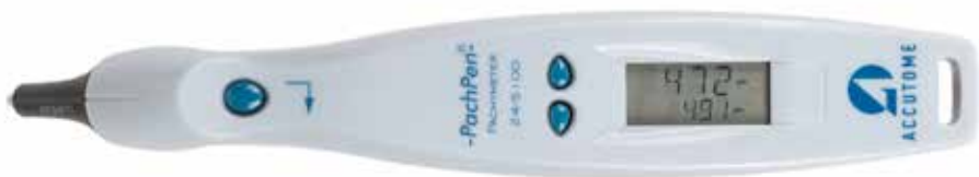
Figure 1.1 - PachPen Pachymeter

The Accutome PachPen pictured below has all the features that make it easy to obtain extreme accuracy and improved patient outcomes.