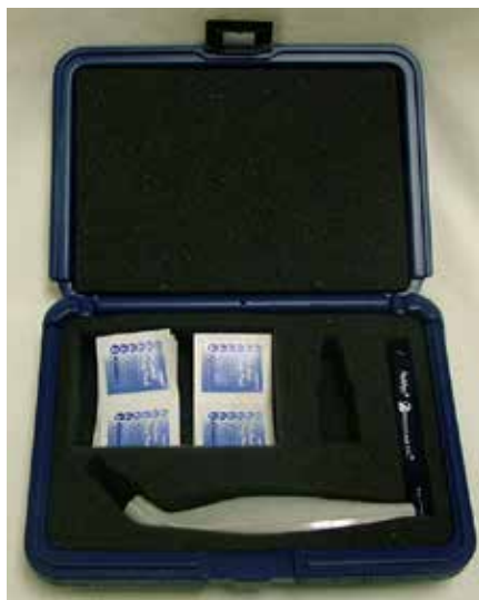
Figure 3.1 - PachPen Unpacked