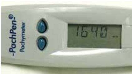
Figure 3.4 - Speed of Sound Screen