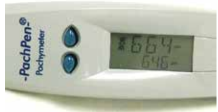
Figure 3.5 - Measurement Screen