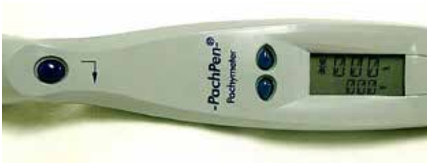
Figure 3.3 - Action Control Buttons and LCD