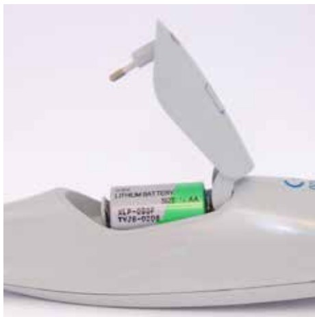
Figure 3.2 - Battery Insertion