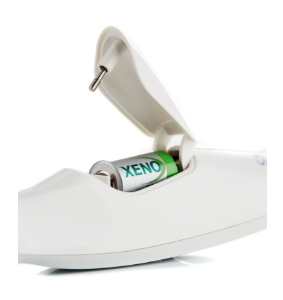
Figure 3.2 - Battery insertion