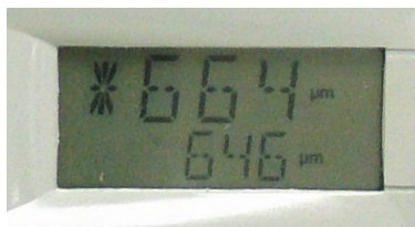
Figure 3.7 - True IOP screen