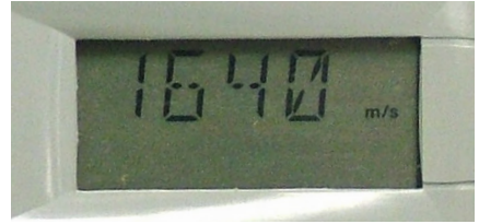
Figure 3.5 - Measurement screen