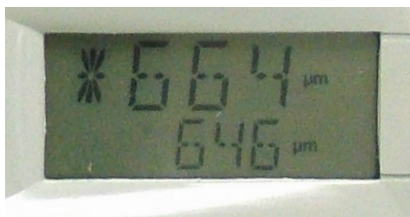
Figure 3.6 - Measurement screen starting new patient