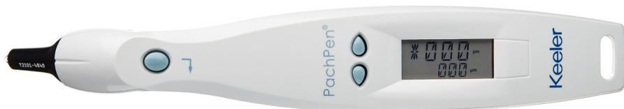
Figure 1.1 - PachPen pachymeter

The Keeler PachPen pictured below has all the features that make it easy to obtain extreme accuracy and improved patient outcomes.