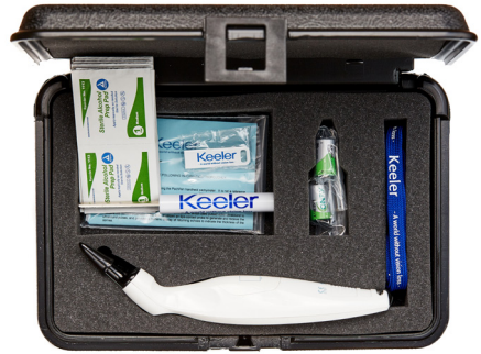
Figure 3.1 - PachPen unpacked