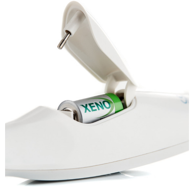
Figure 3.2 - Battery insertion