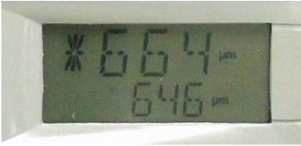
Figure 3.4 - Speed of sound screen